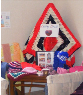
SOME OF THE HAND MADE ITEMS THAT WERE SENT TO CHAPARRAL ON DISPLAY FOR THE OPEN HOUSE