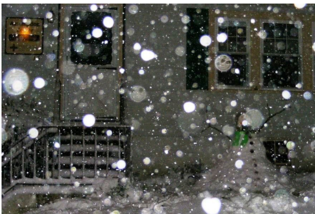
THE AMAS CELEBRATED THE MIRACLE OF SNOW IN OCTOBER WITH THEIR VERY OWN ASSUMPTION CENTER SNOWMAN, SEEN HERE.