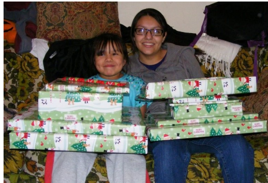
Some of the many smiling faces from gift distribution!