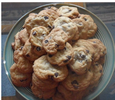
Homemade Assumption Center Cookies!

The Assumption Center Kate O'Neill Spiritual Library will have it's last Saturday Spiritual Snack of 2011 on December 17th. Please stop by any time between 1 and 4 pm. We have a display of Advent books and will be sharing Christmas cookies and discussing our favorite Advent practices. We would love to see you there!