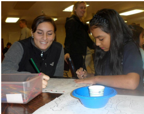
A mentor and student color a holiday picture on their last session together before

very grateful to all of the teachers who donated their time and talent which are so crucial to the success of our ESL program. We will resume classes on January 24th. We look forward to the return of our students.